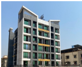
SAFFRON ENCLAVES 7 STORIED TOWERS, MUMBARA STATION PROJECT COMPLETED (O.C. RECEIVED)