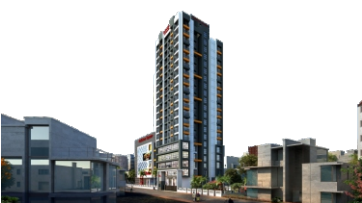
AALISHAN ARCADE / AALISHAN SQUARE SHOPPING CENTER & RESIDENTIAL THEATRE OPP. MUMBARA STATION (ON GOING PROJECT)