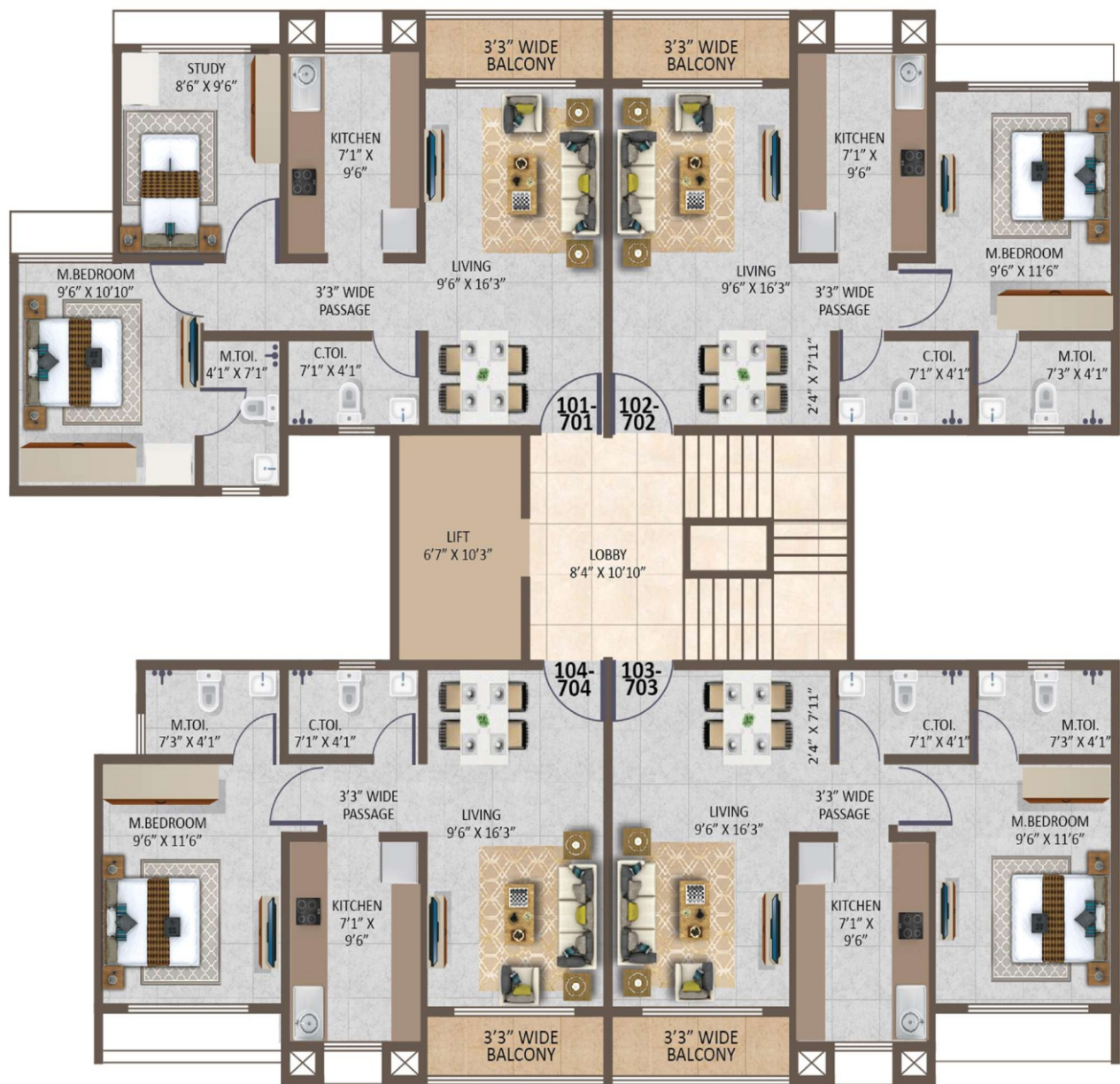
TYPICAL FLOOR PLAN BLDG 3