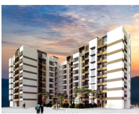
CROWN RESIDENCY 7 STOREY, 3 TOWERS, KAUSA (ON GOING PROJECT)