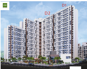
GRACE SQUARE 22 STOREY, 2 TOWERS, KAUSA (ON GOING PROJECT)

Additional amenities that complex your life