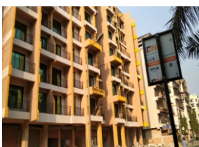
EDEN PARK 7 STORIED TOWERS, OPP METRO STATION TALOJA PROJECT COMPLETED (O.C. RECEIVED)