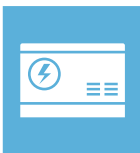
Diesel Power Backup for Common Areas