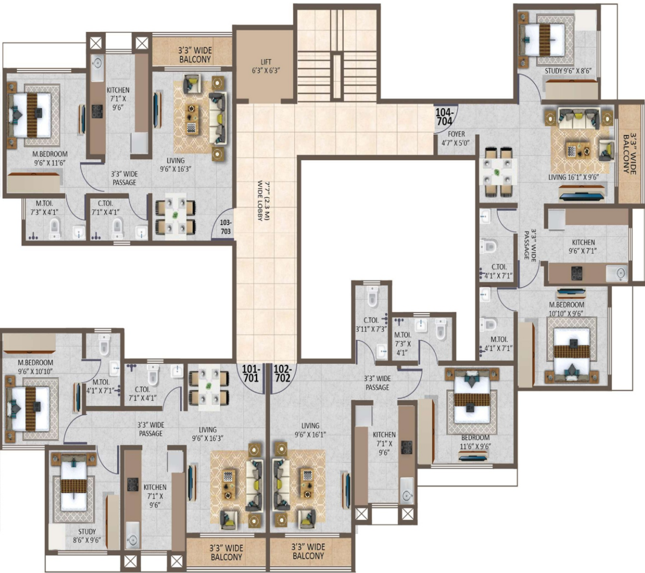
TYPICAL FLOOR PLAN BLDG 5