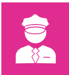
24 X 7 Gated security