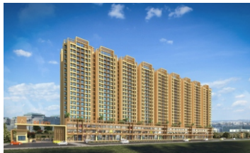
DZCITY 22 STOREY, 3 TOWERS, KAUSA (ON GOING PROJECT)