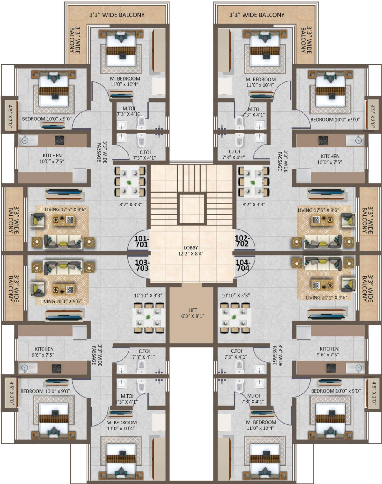
TYPICAL FLOOR PLAN BLDG 1